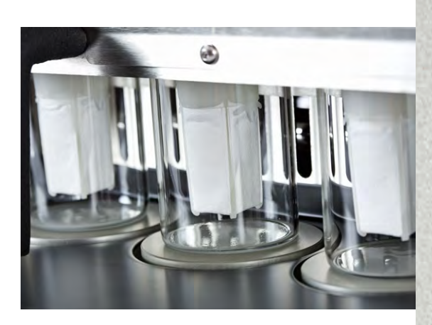
The unique, patented Hydrocap filter contains the sample all the way from initial weighing through hydrolysis to final extraction.