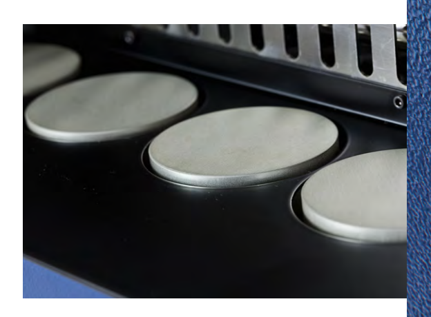
Hotplates with individual temperature control and automatic shutdown feature that allows out-of-hours operation.