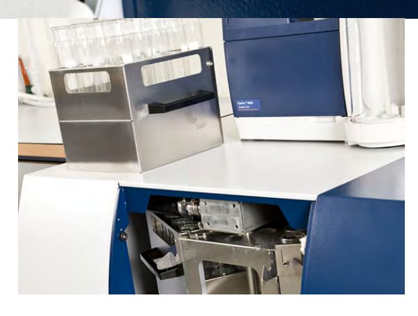
Batch handling and auto sampling for after hours operations.