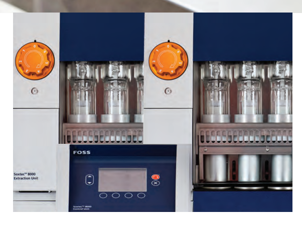
Operate two solvent extraction units from one control unit for reduced manual handling.

*The European standard for determination of acid detergent fibre (ADF) and acid detergent lignin (ADL) in feed and the AOAC standard for fat analysis