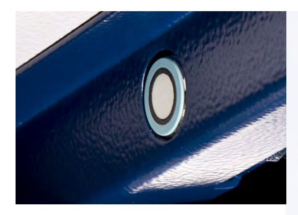
Built-in safety sensors for improved operator safety.